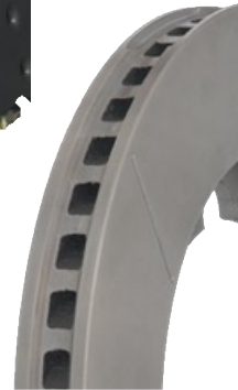
GT Rotor (140-XXXX)