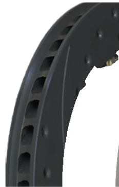
SRP Rotor (140-XXXX-D)

maximize cooling surface area, forty-eight individual air passages are cast internally into each rotor. Air passages or vanes are directional and curved for increased airflow over standard straight vented rotor designs. The slotted surface and optionally available cross-drilled holes improve pad to rotor contact by wiping the pad clean and allowing brake dust and gases to be easily exhausted.