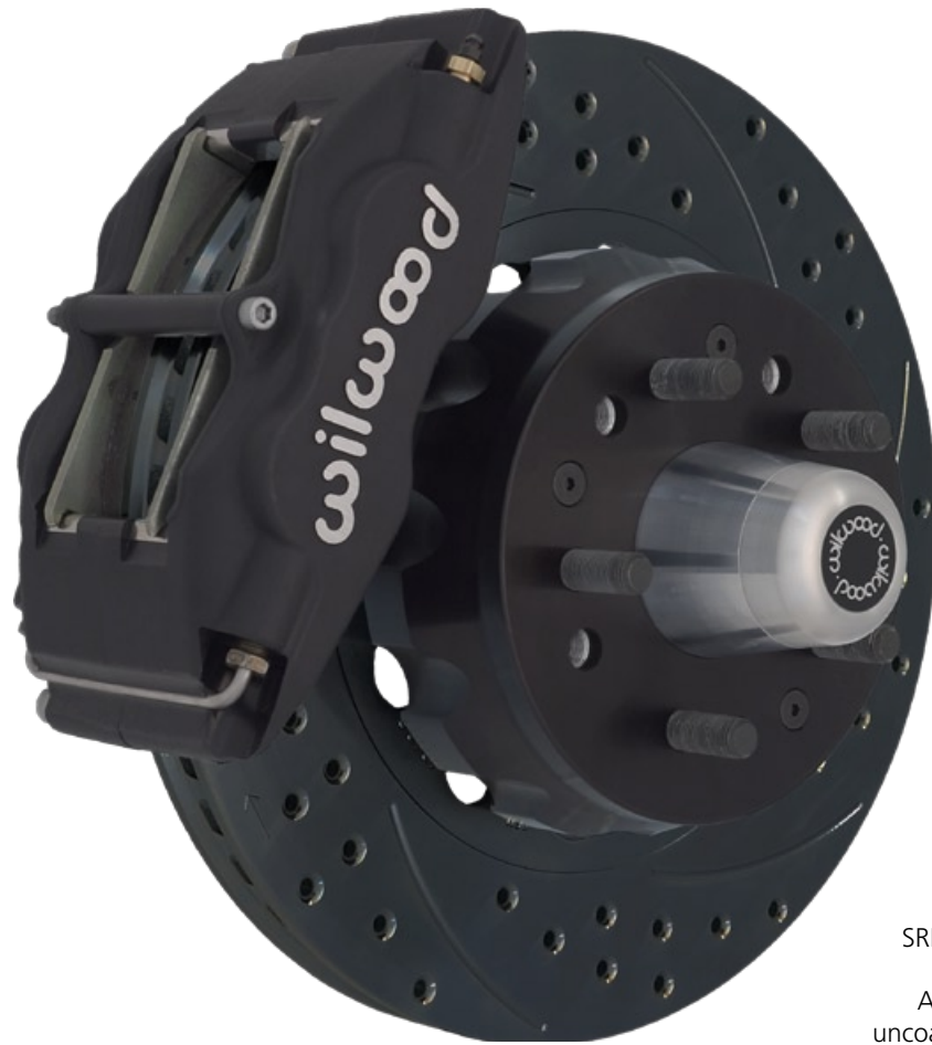
SRP Series Rotor shown

Available with slotted, uncoated, GT Series Rotor