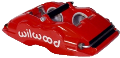
Optional red powder-coated caliper

Calipers use one-piece, stainless steel pistons and high temperature, square faced bore seals. Stainless steel slows heat transfer to the brake fluid and improves the system's resistance to heat induced pedal fade. This reduction in heat also increases the service life of the fluid and seals. The four individual pistons apply pressure against both sides of the rotor. Caliper fluid requirements are matched to the output capabilities of commonly used factory master cylinders for comfortable performance in a wide range of applications.