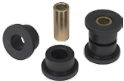
TCP MM-FD-03 Replacement Bushing Set Includes : 4 bushings, 2 sleeves