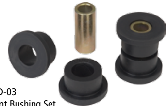
TCP MM-FD-03 Replacement Bushing Set Includes : 4 bushings, 2 sleeves

Our poly-urethane bushed motor mount assemblies provide a high performance, direct replacement alternative to bonded rubber factory mounts and are available for small block and big block applications. A unique, double-shear, through-bolt design eliminates any chance of motor mount separation during normal use. Shims allow the fore/aft position of the motor to be varied within a 1/2" range centered at the stock position. The mount features graphite impregnated poly-urethane bushings with seamless internal sleeve and external housing. Transferred vibration is increased over factory levels but without the harshness commonly found using completely solid mounts.