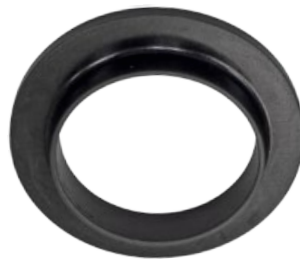
Urethane Spring Isolators