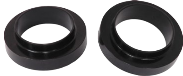
TCP SVM1-03 - 1" thick spring isolators, black urethane, raises ride height approximately 1-1/4"