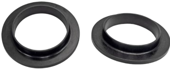
TCP SVM1-01 - 1/4" thick spring isolators, black urethane, standard height

Our coil-spring isolator is required with all VR springs. The coil-spring wire is a different size than stock so the original isolator will not fit correctly. Made from high strength black polyurethane for long life. Sold in pairs.