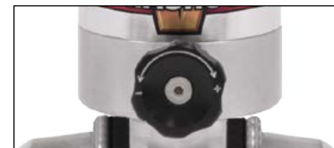
QuickSet 1 Single Adjustable