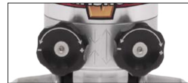
QuickSet 2 Double Adjustable