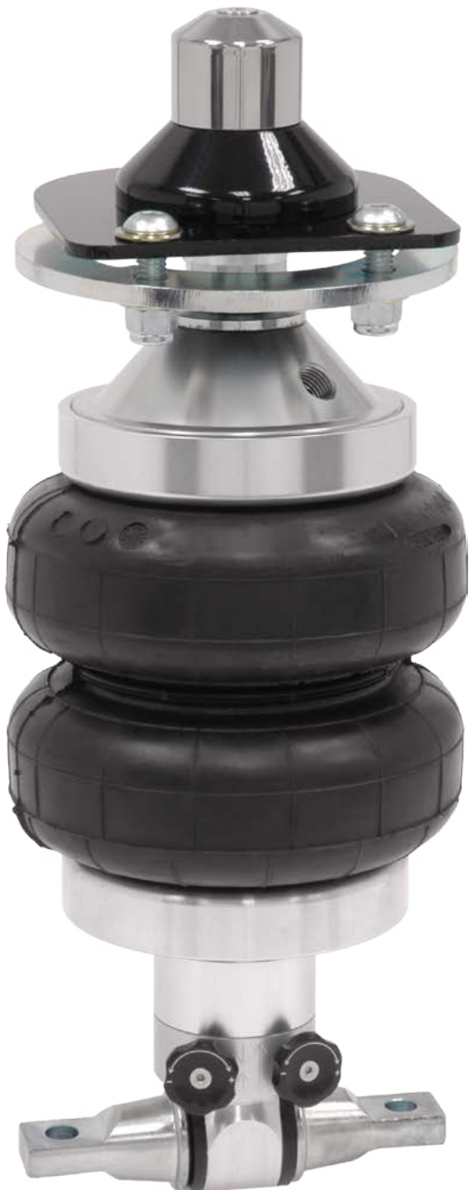
Polished-Billet-Stainless Cap (optional)

Adapter mounts are black powder coated and can be fit with an optional polished-stainless-steel cap for an extremely clean and finished appearance.