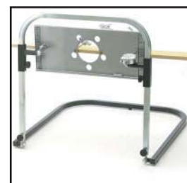
Bump Steer Gauge